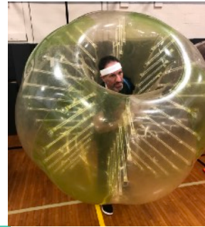
Bubble Ball Soccer at EMS!!

On Friday, December 21st, we held our PBIS 2nd quarter incentive, which was a thrilling game of staff vs students bubble ball soccer! Students either paid 3 Laker Bucks or donated 3 canned food items to the W-E food pantry to attend the game. Many students then opted to enter a raffle to be chosen to play in the game, as well. There were several fantastic raffle items that students could enter to win too. Overall, it was a great experience and fun was had by all!