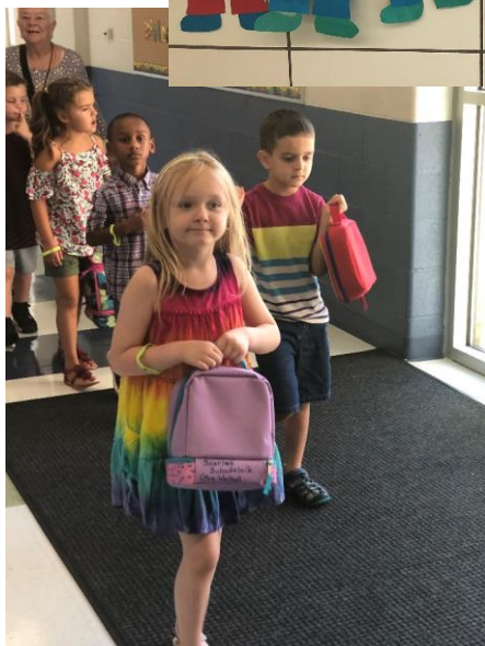
Kindergarteners are already learning how to SOAR!