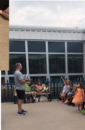
Second graders setting goals for the school year