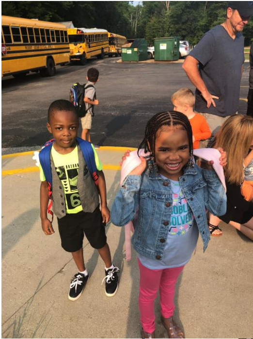
Kindergarteners 1 st days of School