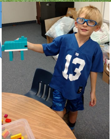
Makerspace Makers 3D Pens and Legos are our favorites!