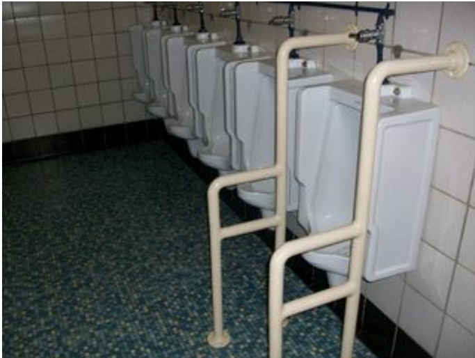
Toilet room fixtures