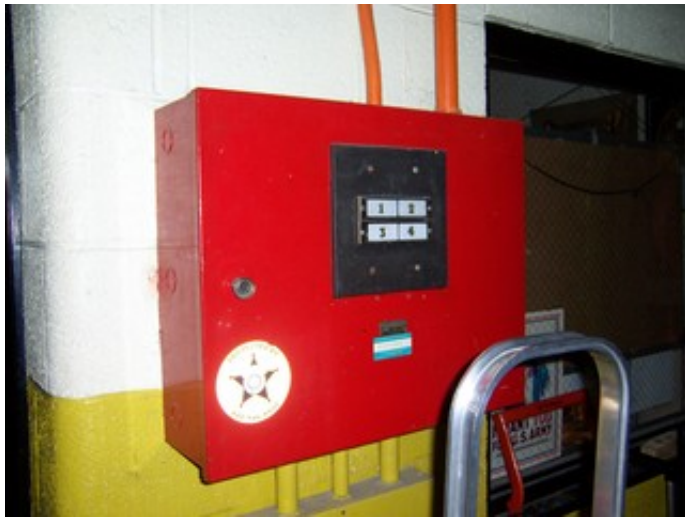
Fire Alarm Control Panel