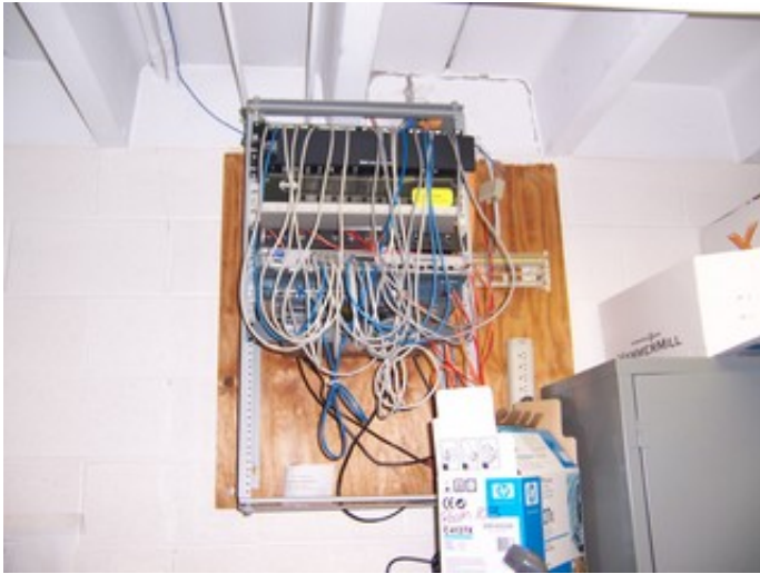
Technology Head-End Equipment Rack