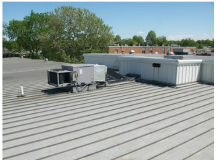
Rooftop Air Conditioning Unit