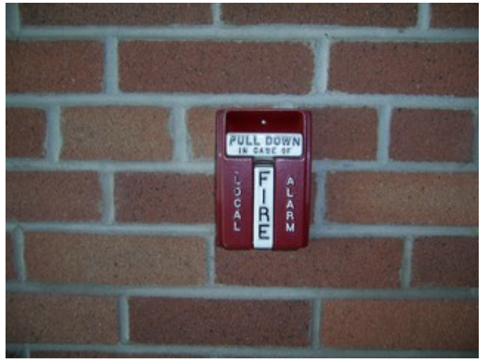
Typical Fire Alarm Device