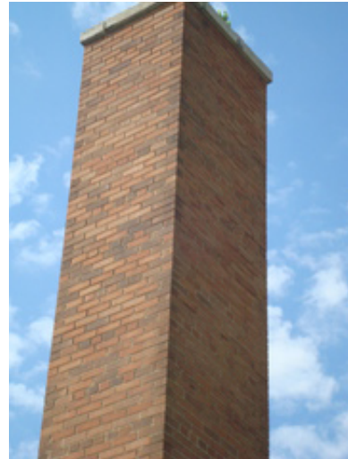
Chimney on 1962 Addition