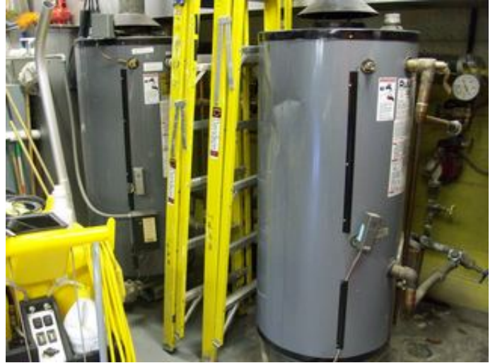
Domestic water heaters