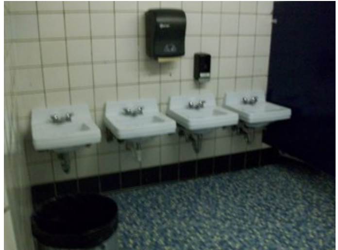
Toilet room fixtures