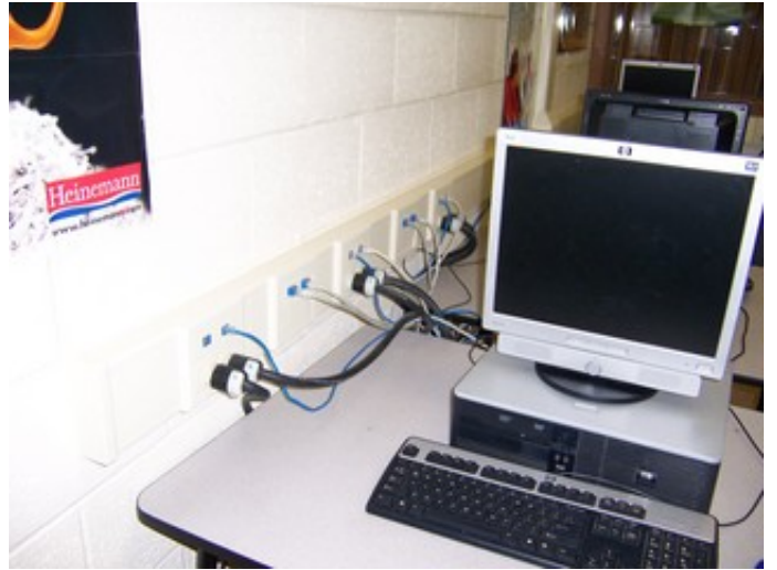
Typical Technology Outlets