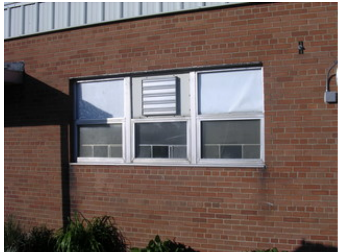
Typical aluminum windows.