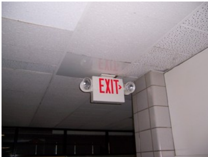
Typical Exit Sign with EM. Heads