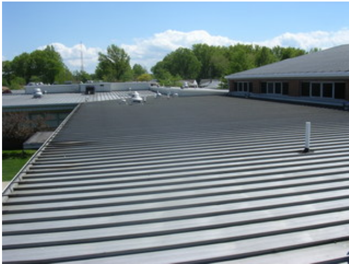
Typical standing seam roofing.