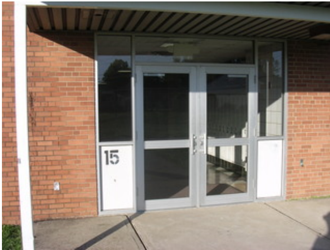
Typical aluminum doors.