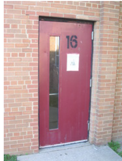
Typical hollow metal doors.