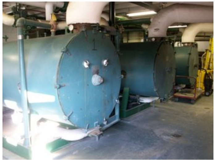
Gas Fired Hot Water Boilers