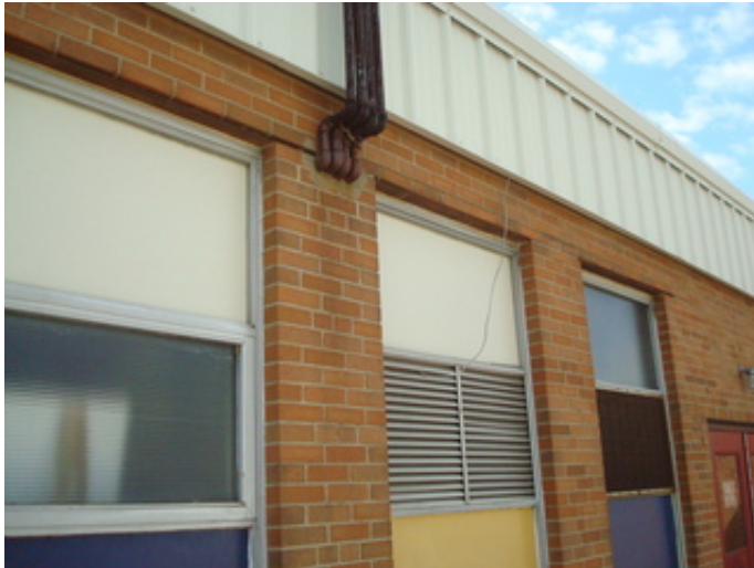
Deteriorating lintels and brick