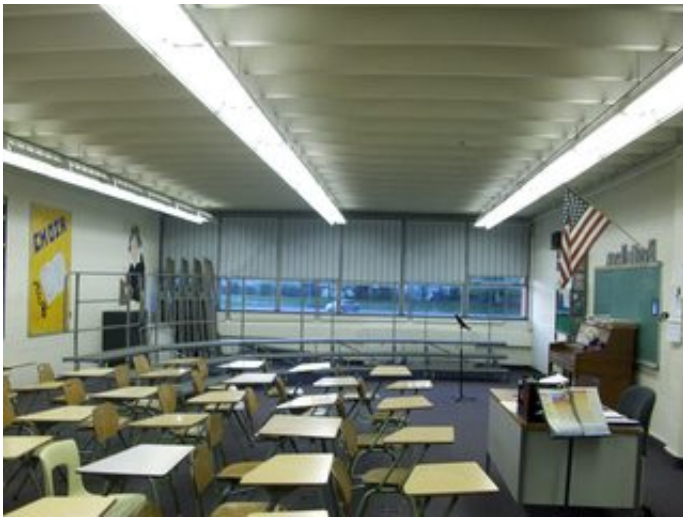
Typical Classroom Lighting