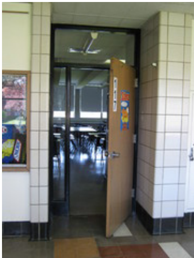
Typical recessed classroom door