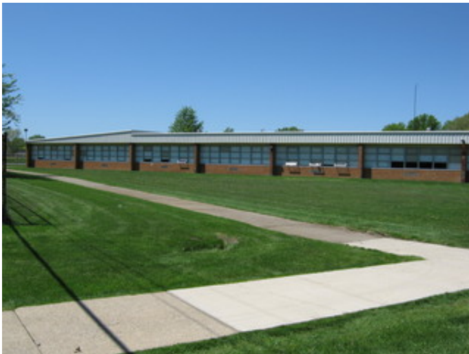
South elevation photo: