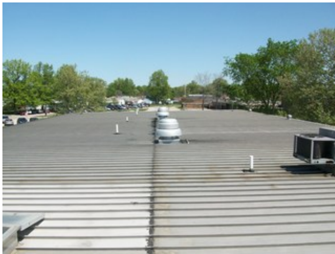
Rooftop Exhaust Fans