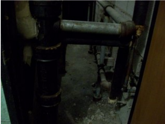
Sanitary drainage Piping