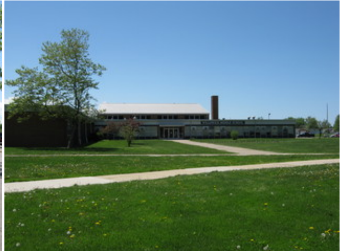
East elevation photo: