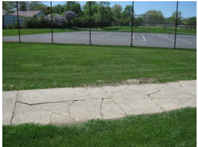
Sidewalk in poor condition