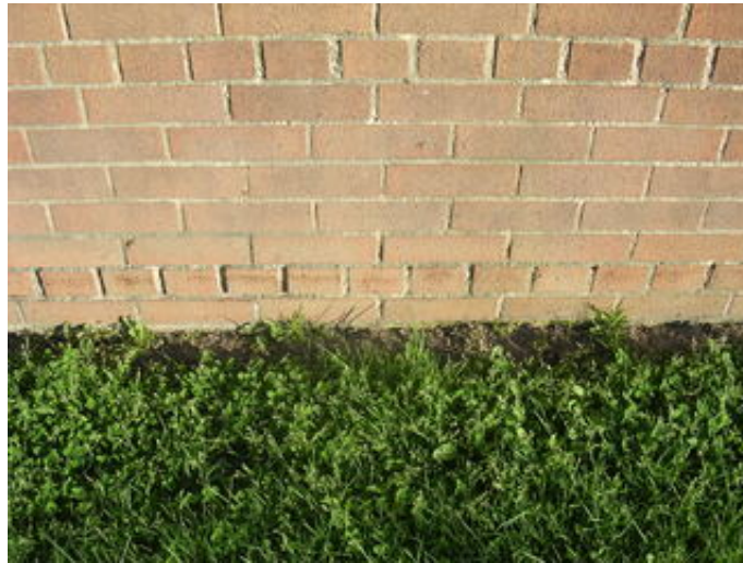
Typical foundation condition.