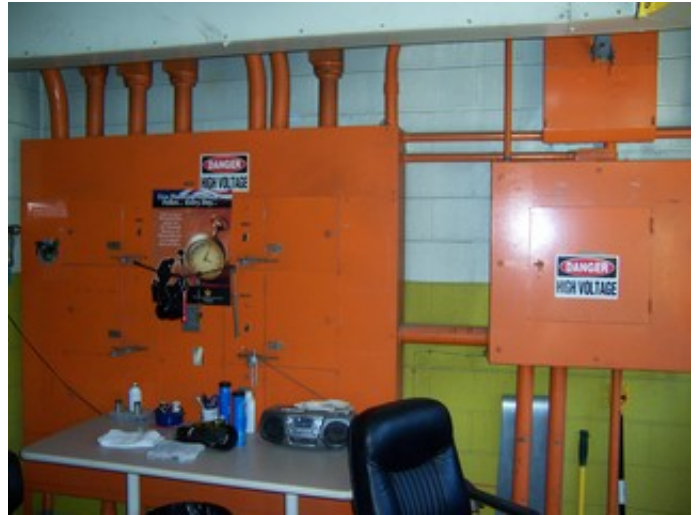
Main Distribution Switchboard