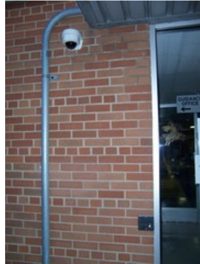
Security Camera and Keypad