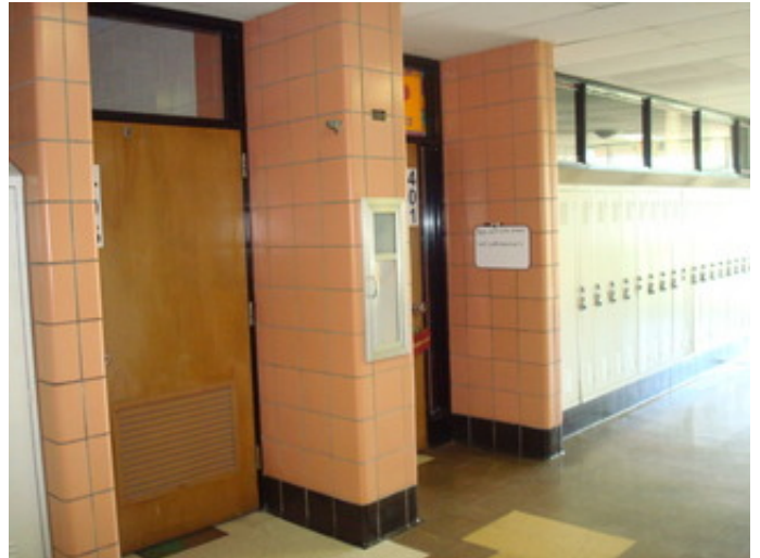
Fire extinguisher cabinet