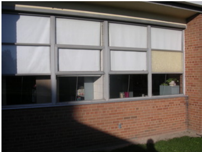
Typical aluminum window system.