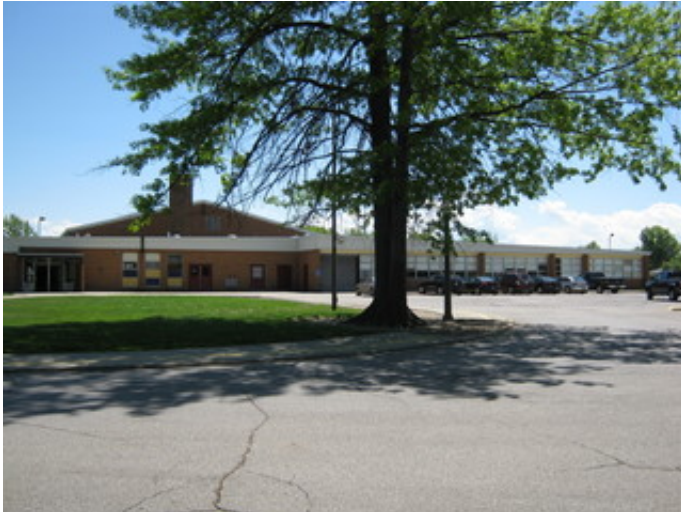
North elevation photo: