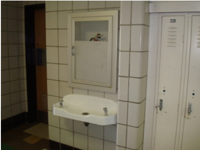
Fire extinguisher cabinet