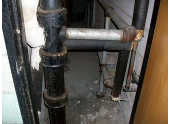
Sanitary drainage Piping