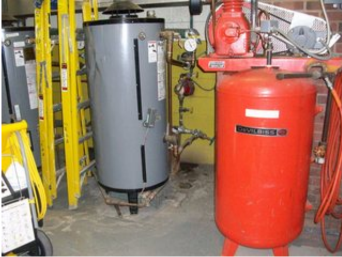
Domestic water heaters