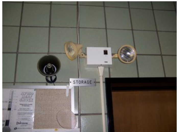
Typical Emergency Light