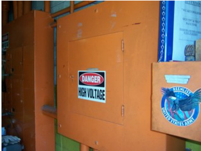
Main Disconnect Switch