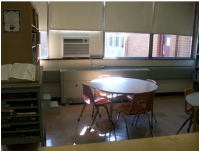
Typical Unit Ventilator