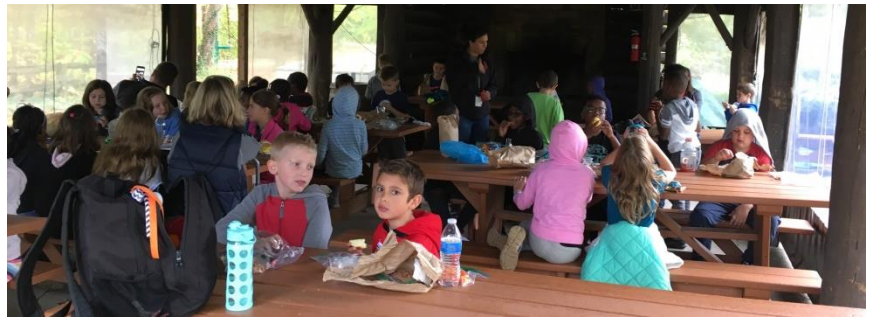
3rd grade brought their learning outdoors at the Holden Arboretum