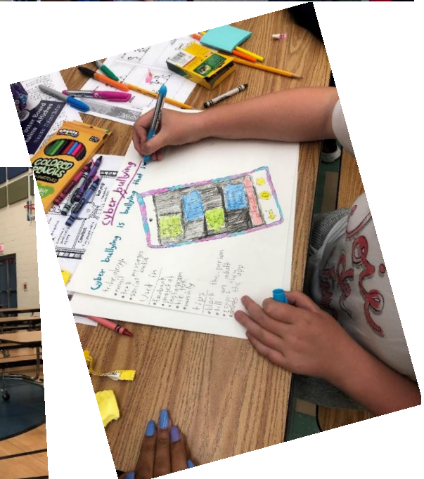
Bullying Busters – thank you to all families who attended!