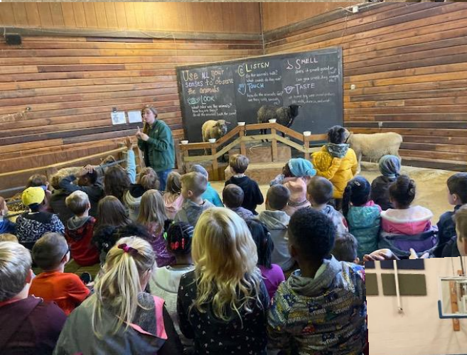
1 st grade visited the Lake Farm Parks