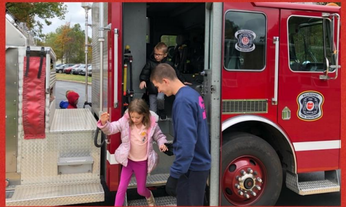
2 nd Grade Safety Visit from Willoughby Fire Department