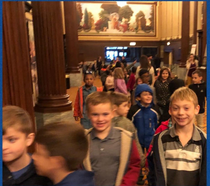
2 nd Grade Field Trip to the Ohio Theater to see The Jungle Book